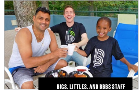
BIGS, LITTLES, AND BBBS STAFF ENJOYED A DAY OF FUN BY THE POOL

Our Bigs and Littles had a wonderful time at our annual pool party at The Atlantic Club. They enjoyed swimming and mingling with one another while making fun memories!